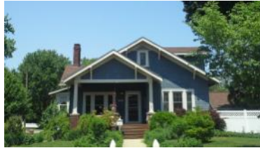
The Biskner Home, 706 Midland St

Door prizes will be awarded at each featured home — need not be present to win!