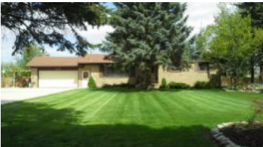
The Witzgall Home, 5179 Two Mile