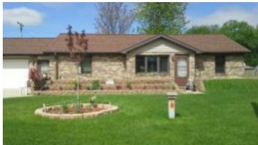
The Morley Home, 4670 Foxcroft