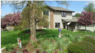
The Starr Home, 4680 Foxcroft