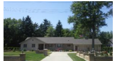
The Traxler Home, 4582 S. Two Mile