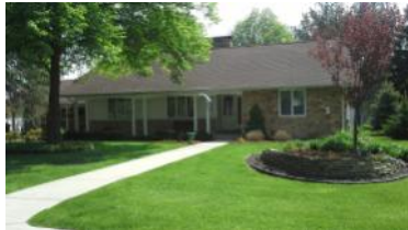
The Birch Home, 4657 Willow Dr.