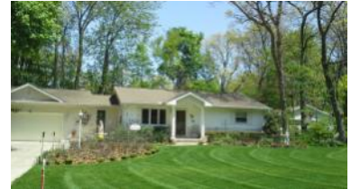
The Kaplenski Home, 303 Oakdale